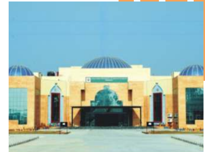
Baba Farid University of Health Sciences, Faridkot

Nursing contributes to the health services in a vital and significant way in the health care delivery system. It recognizes national health goals and is committed to participate in the implementation of National Health policies and programmes. It aims at identifying health needs of the people, planning and providing quality care in collaboration with other health professional and