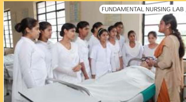
FUNDAMENTAL NURSING LAB