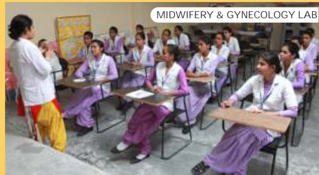
MIDWIFERY & GYNECOLOGY LAB